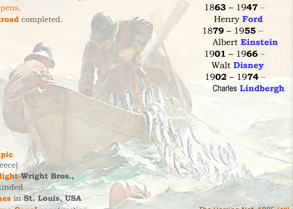
The Herring Net , 1885 (49).