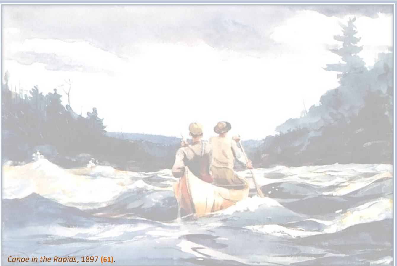
Canoe in the Rapids, 1897 (61).