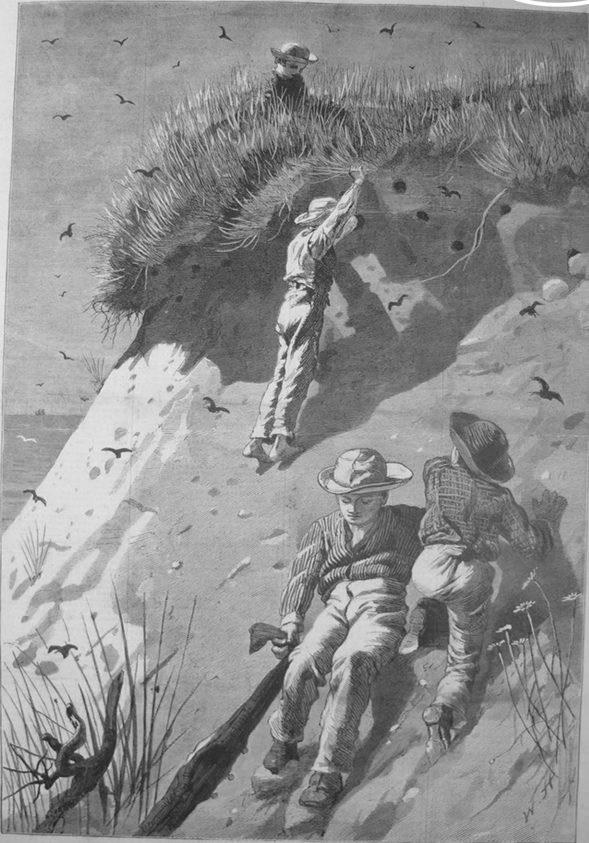
RAID ON A SAND-SWALLOW COLONY—"HOW MANY EGGS?"—[DRAWN BY WINSLOW HOMER.]