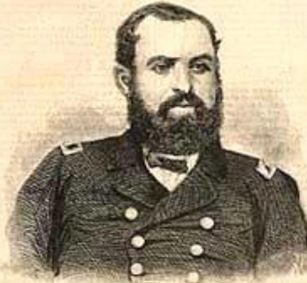
LEUTENANT MARTIN S.A.A. IN ACTION, THE "WHITTAKER" (Photographed at New York, N.Y.)

The illustration of the fight at Chickamauga, Georgia, is a fine example of the art of the lithographer. It shows the Southern soldiers in a state of confusion and retreat, with their ranks broken and their arms scattered. The scene is set in a wooded area, with the smoke of battle rising in the air. The artist has captured the chaos and the intensity of the moment with great skill and detail.