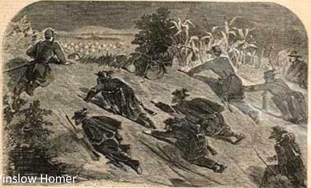
A BRIGHT MOMENT OF THE BATTLE.