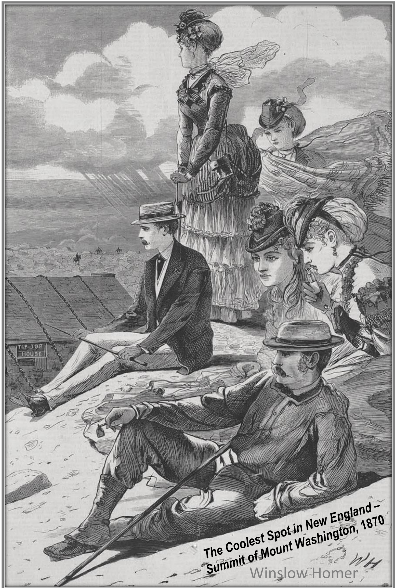
The Coolest Spot in New England - Summit of Mount Washington, 1870 Winslow Homer